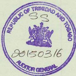
MAJEED ALI ACTING AUDITOR GENERAL